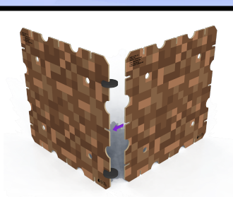
Always start with a connen-